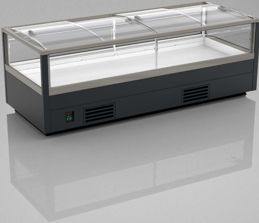
Imja WNIJ-05 2500 CCS

CCS – cover | single, curved | sliding (sideways)